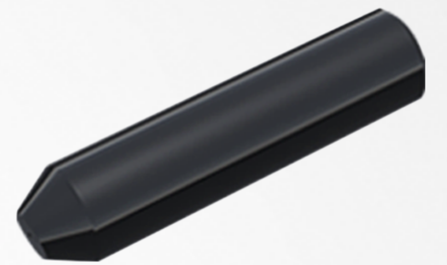
Black LC Ferrule