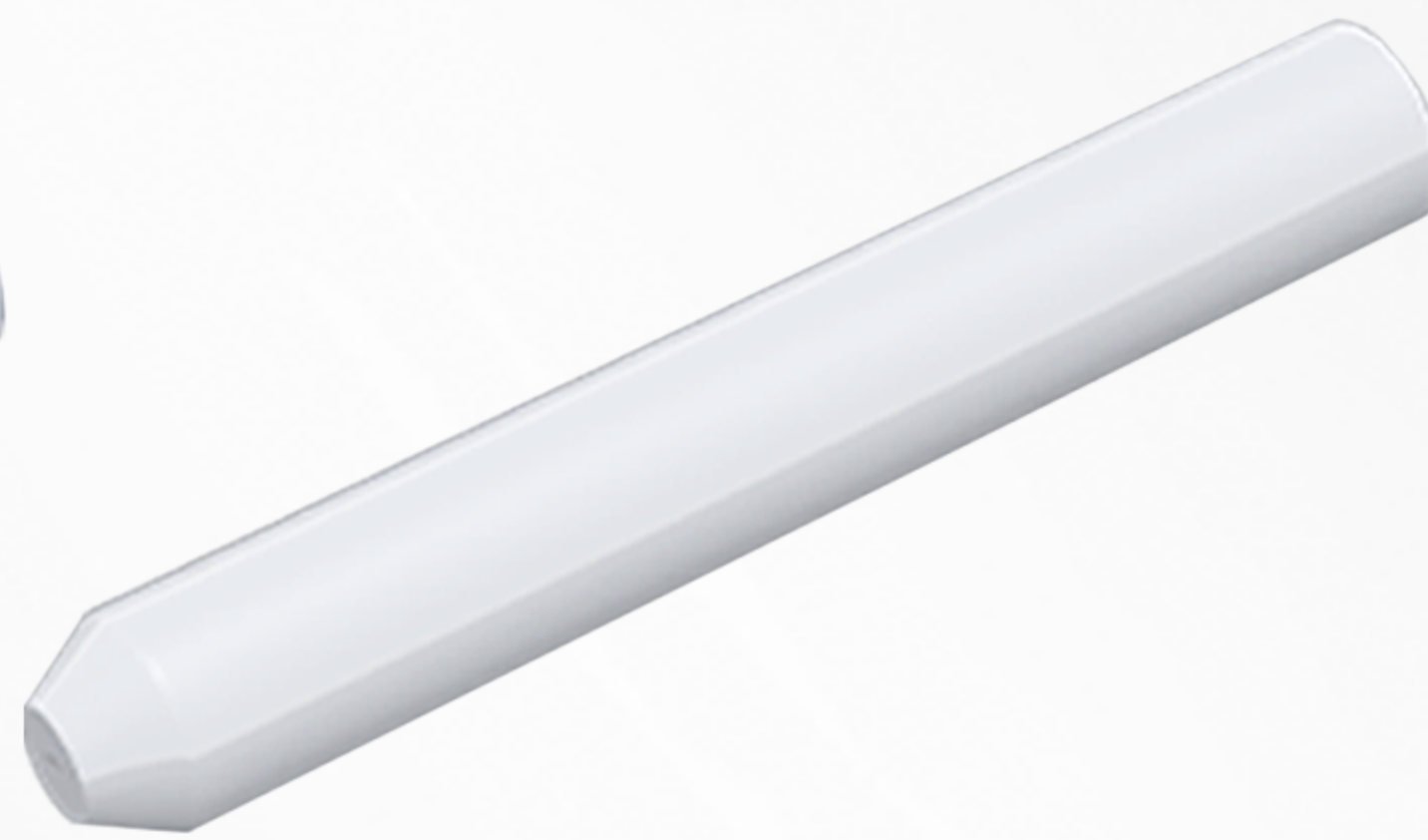
LC ferrule with special length