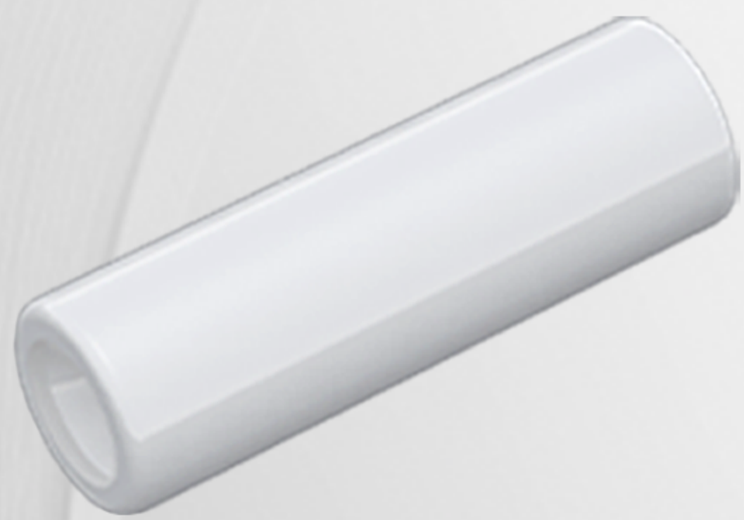
Concentricity at both ends

Tailored Solutions for Fiber Optic, Medical & Industrial